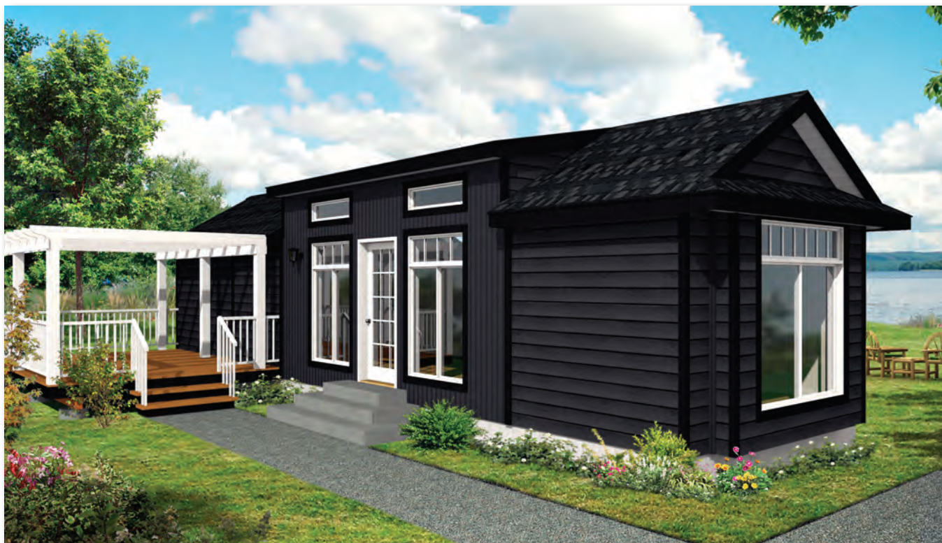
2 BDRM, 1 BATH, FRONT BDRM | 12'x44' | 536 sqft | 12PM44006